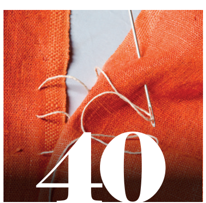
THE UPCYCLE CONUNDRUM