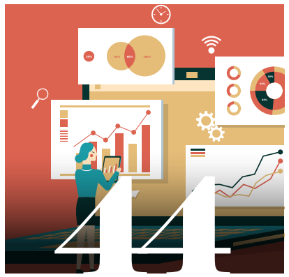
FOLLOW THE MONEY